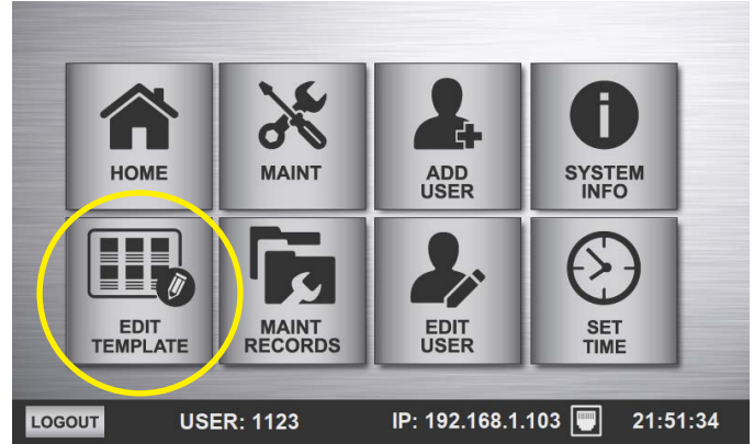
Customizable certificates of destruction