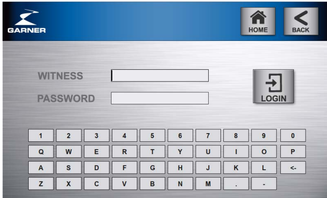
Secure user and witness login